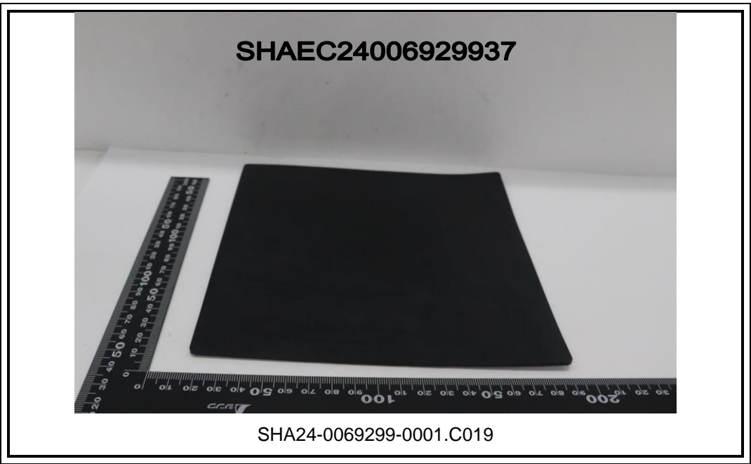
SGS authenticate the photo on original report only *** End of Report ***